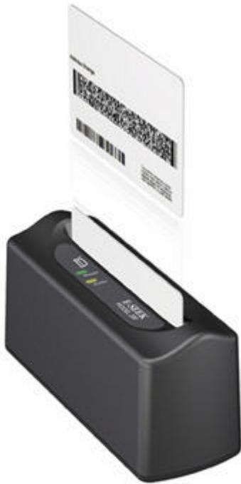
InData Systems VeriFone Age Verification Upgrade unit

How do you help prevent the sale of age-restricted items to minors, and keep customers and cashiers smiling? This unit can help with both issues.