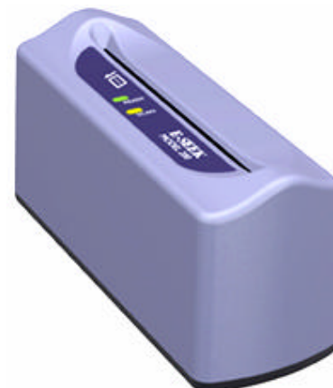
Age Verification Upgrade Reader

The AAMVA (American Association of Motor Vehicles Administrators) is a group that has set standards that most states follow for their driver's license design and formats. PDF-417 is a 2 Dimensional barcode that is able to encode a large amount of data including the license holders address and date of birth among other things.