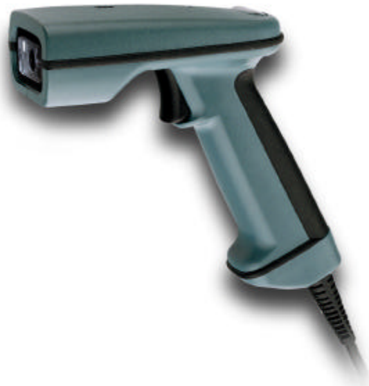
InData Systems 4410-VeriFone Scanner