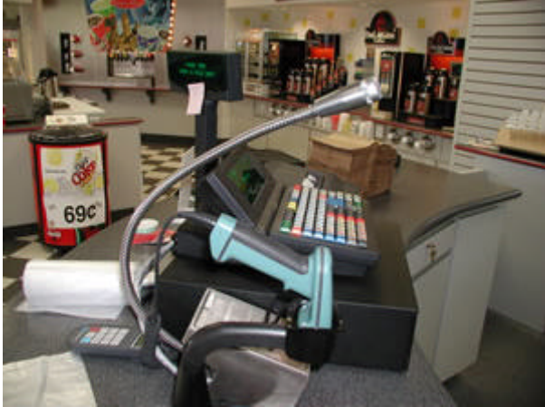
Ruby Terminal and Scanner

How do you help prevent the sale of age-restricted items to minors, and keep customers and cashiers smiling? This unit can help on both counts.