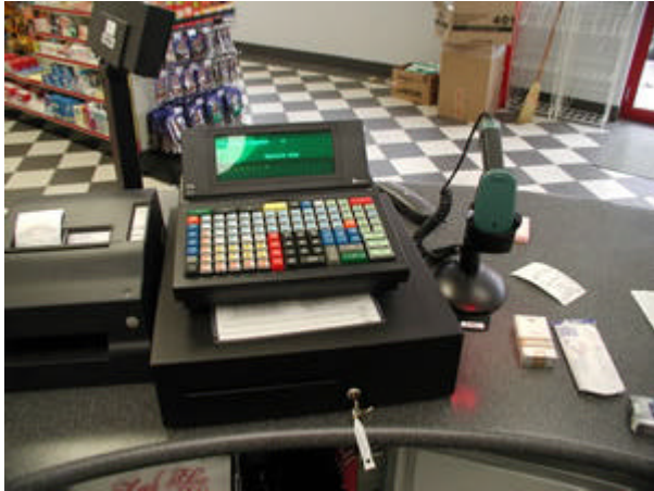
Ruby Terminal and Scanner

Owners like the compliance aspect. Cashiers like the speed and convenience. Everyone likes how it is part of a comprehensive compliance and awareness program that helps keep operations running smoothly.